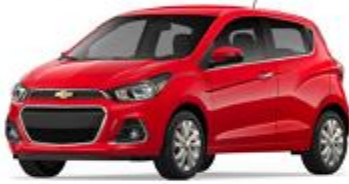
Win this 2017 Chevy Spark Donated by VanDevere Chevy (or take a $9,000 Payout Option)

Call DiStefano Insurance for a FREE, no obligation review of your Home & Auto insurance package and we will donate a raffle ticket in your name to the 2018 SPJ Car Giveaway!