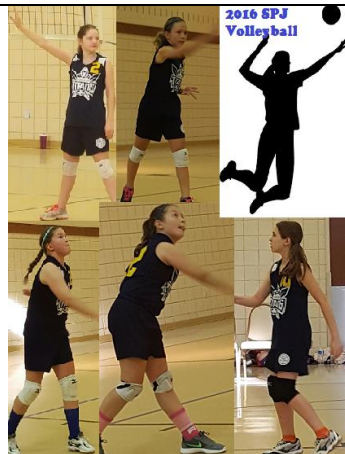
2016 SPJ Volleyball